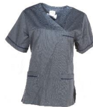
Health Care Assistants