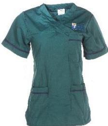
Advanced Nurse Practitioner