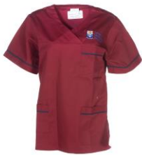
Clinical Nurse Specialist