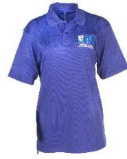
Food Service Assistant